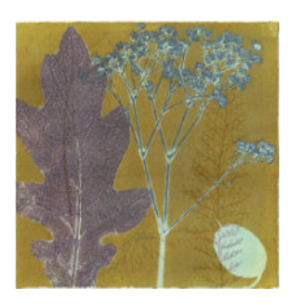
'Autumnal Gathering' by Wendy Tate Mono-Print 8in x 8in £40