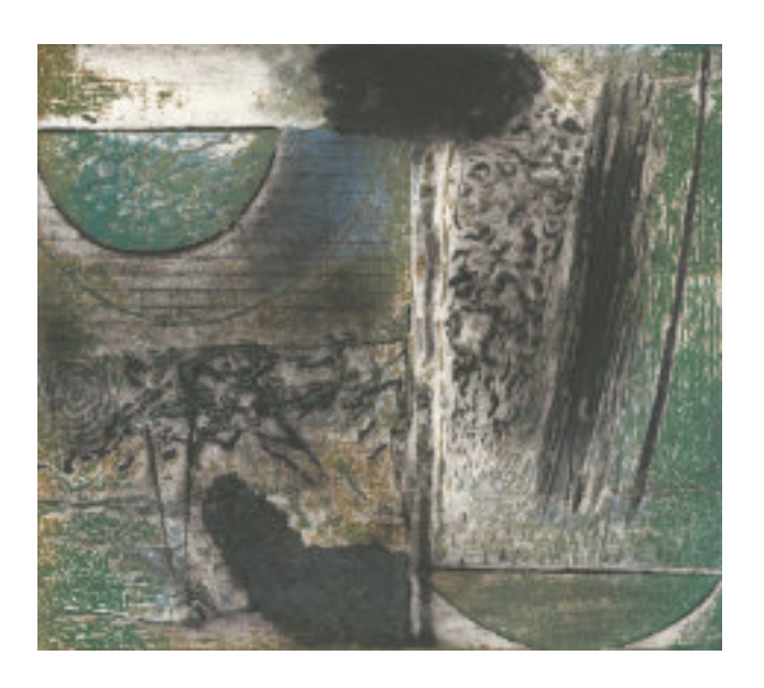
'Tipping Point' by Rob Moore