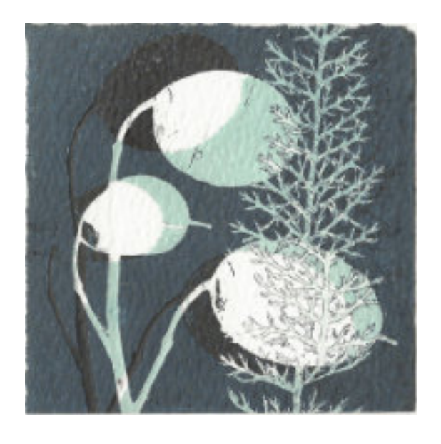
'Honesty in Green and Black' by Wendy Tate