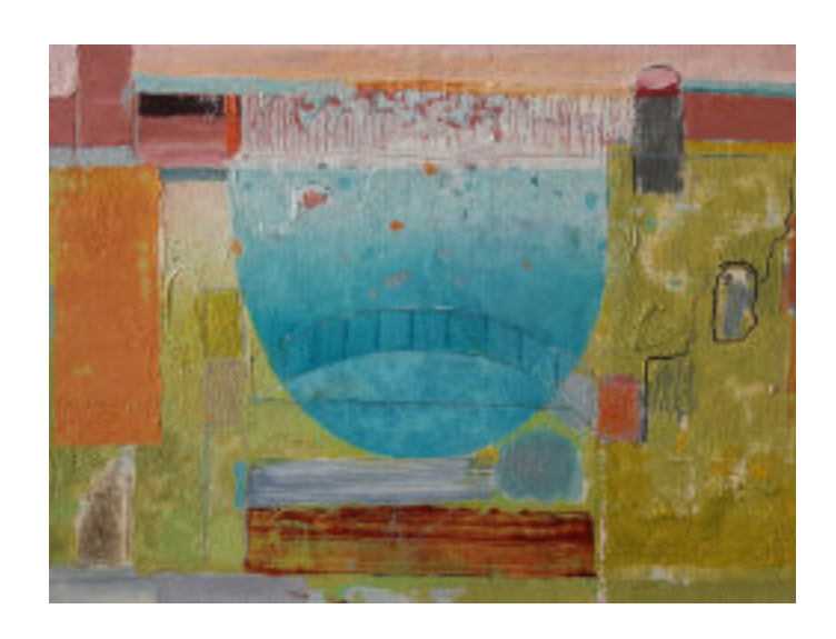
'Day Trip' by Rob Moore Oil on Board 33cm x 38cm £200