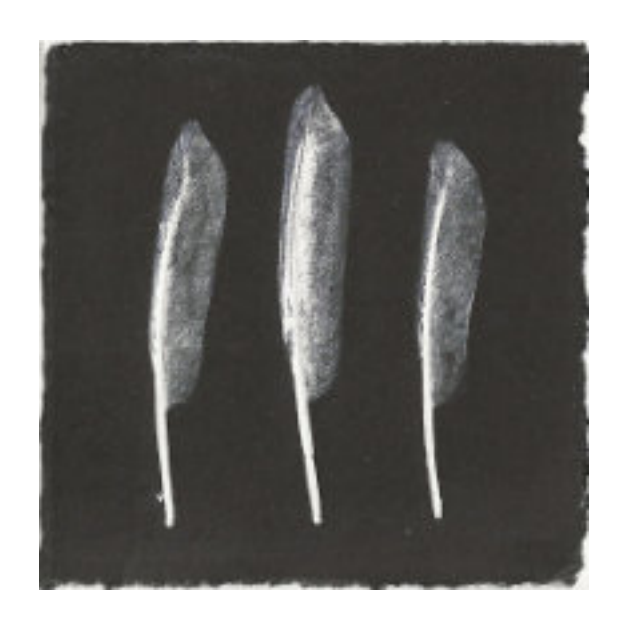
'Three Feathers' by Wendy Tate