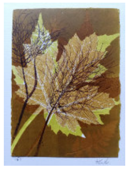
'Autumnal Dance III' by Wendy Tate Mono-Print £50