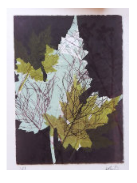
'Autumnal Dance II' by Wendy Tate Mono-Print £40