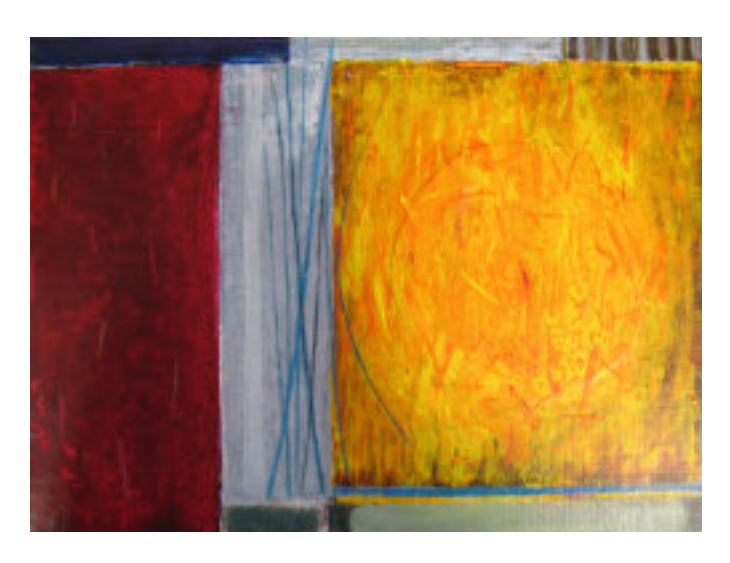
'Core (Study)' by Rob Moore Oil on Board 38cm x 43cm £225