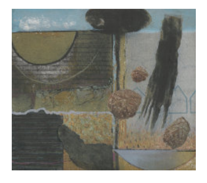
'Breach' by Rob Moore Unique Collagraph 43cm x 47cm £245