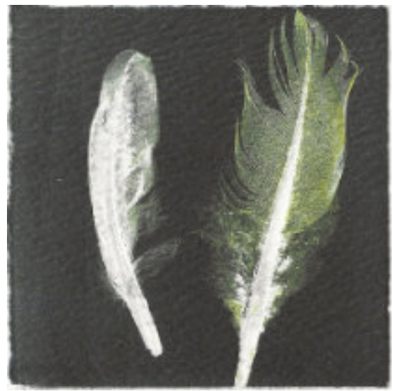
'Dancing Feathers I' by Wendy Tate