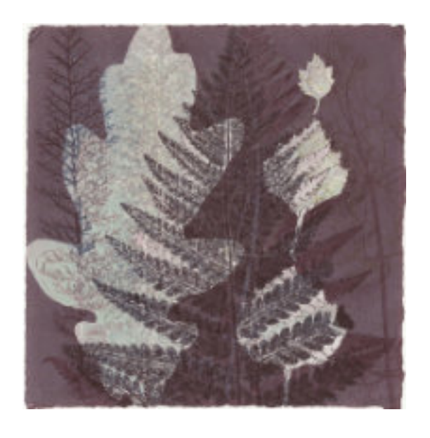
'Rich Botanicals' by Wendy Tate