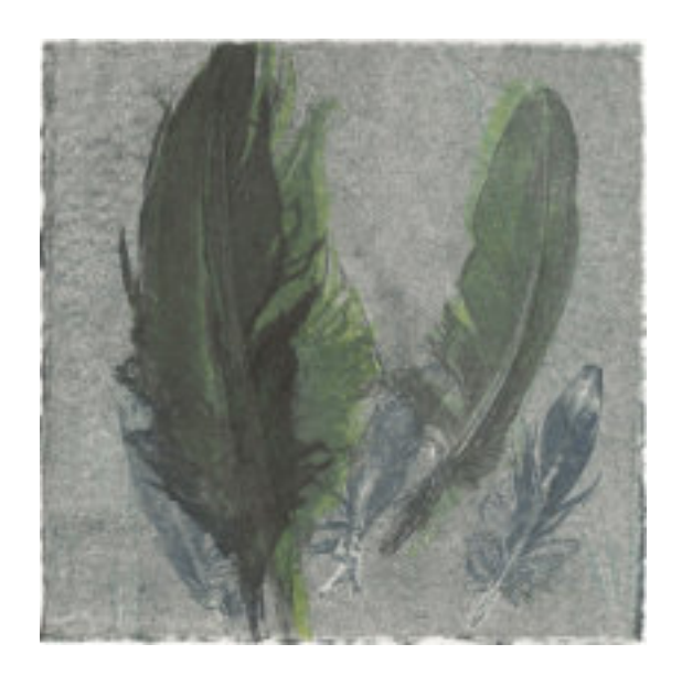
'Dancing Feathers II' by Wendy Tate