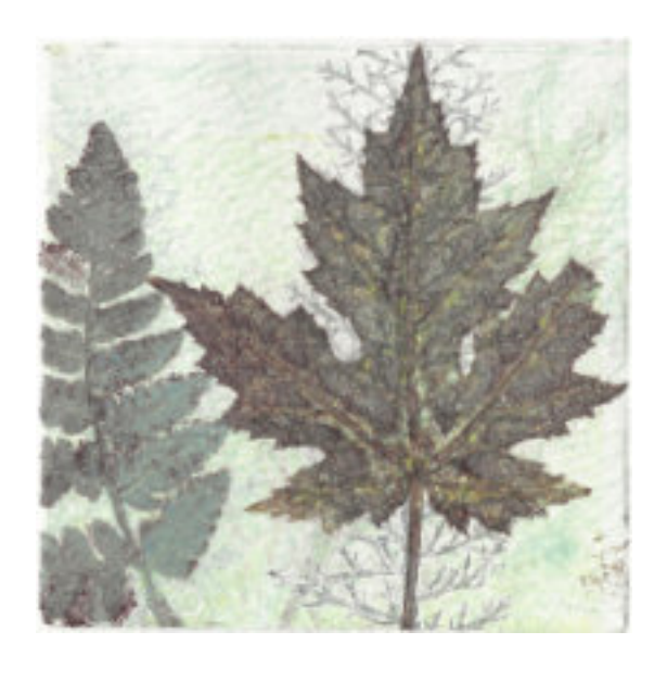
'Beautifully Fallen' by Wendy Tate