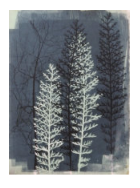
'Luminance' by Wendy Tate