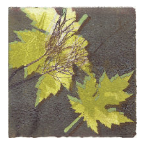
'Fallen Together' by Wendy Tate