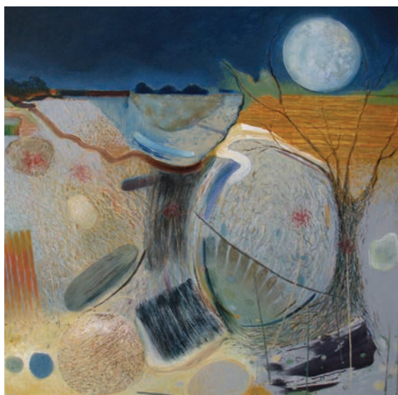
'No Harvest Moon' by Rob Moore