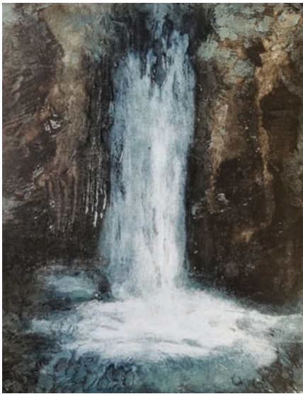
'Torrent' by Wendy Tate

Mixed Media on 640 gms paper 63cm x 83cm £525