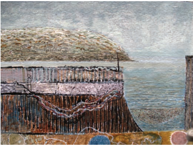
'East Coast' by Rob Moore