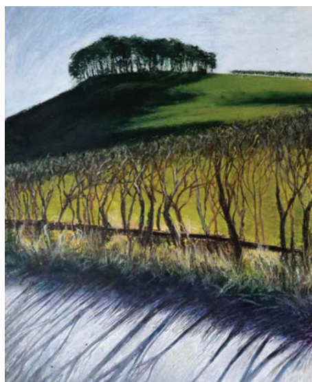
'Shadowed Lands' by Wendy Tate