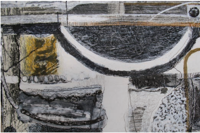
'Time and Tide' by Rob Moore

Mixed Media on 640 gms paper 63cm x 83cm £525