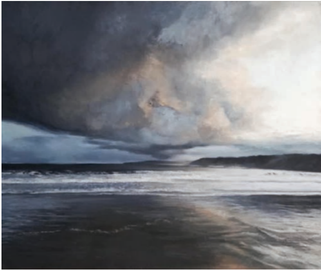
'Deep Calls to Deep' by Wendy Tate