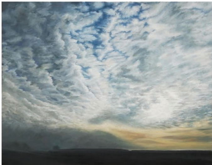
'Moorland Sky' by Wendy Tate