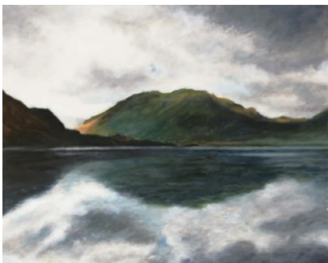
'Mirrored Land' by Wendy Tate